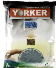
Yorker 250 gm