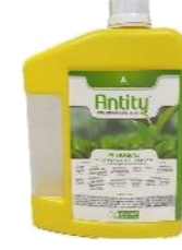
Antity 500 ml