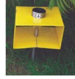
Solar Light Sticky Trap 1 no