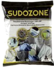
Sudozone 500 gm