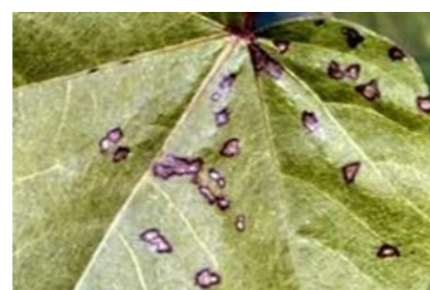
Angular leaf spot