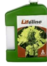
Lifeline 500 ml