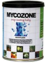
Mycozone 100 gm