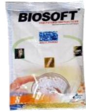
Biosoft 500 gm