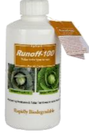
Runoff 100 250 ml