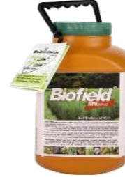
Biofield Combo 3 kgs