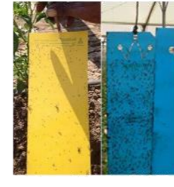
Yellow / Blue Sticky Traps 40 nos