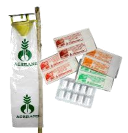
NoMate Pheromone Traps 20 nos